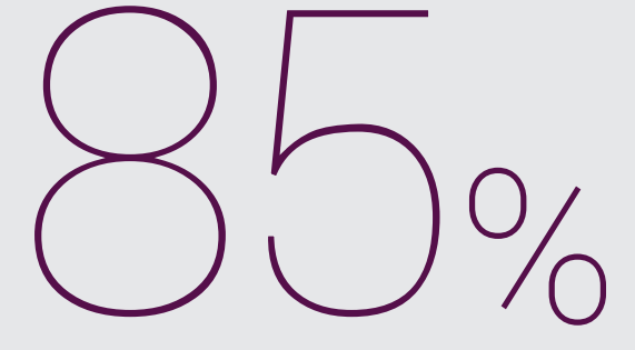
Median Bonus Pay Gap